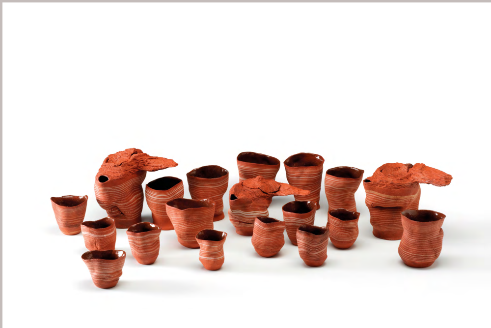
郭家飛《山丘》赤陶器 Kwok Ka-fei "Grand Canyon" Terracotta