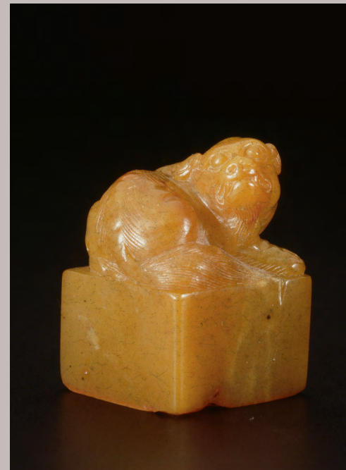
明代程邃《白文獸鈕田黃石方印章》 Cheng Sui "Square seal with four incised characters" Ming dynasty

The Flagstaff House Museum of Tea Ware started the "Tea Ware by Hong Kong Potters Competition" in 1986, aiming to promote ceramic art in Hong Kong. The Competition in 2018, the 11th edition, attracted a record of 332 participants and 451 entries. The exhibition features 101 items of selected tea ware made by 88 local potters.