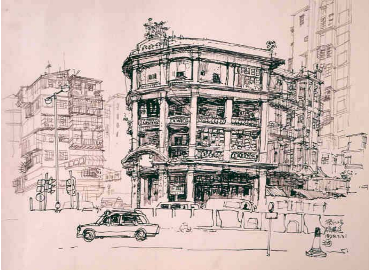
Face Full of Hardships (An Old House at Tong Shui Road, Sham Shui Po)/1990 Drawing ink and colour on paper Collection of the Hong Kong Museum of Art