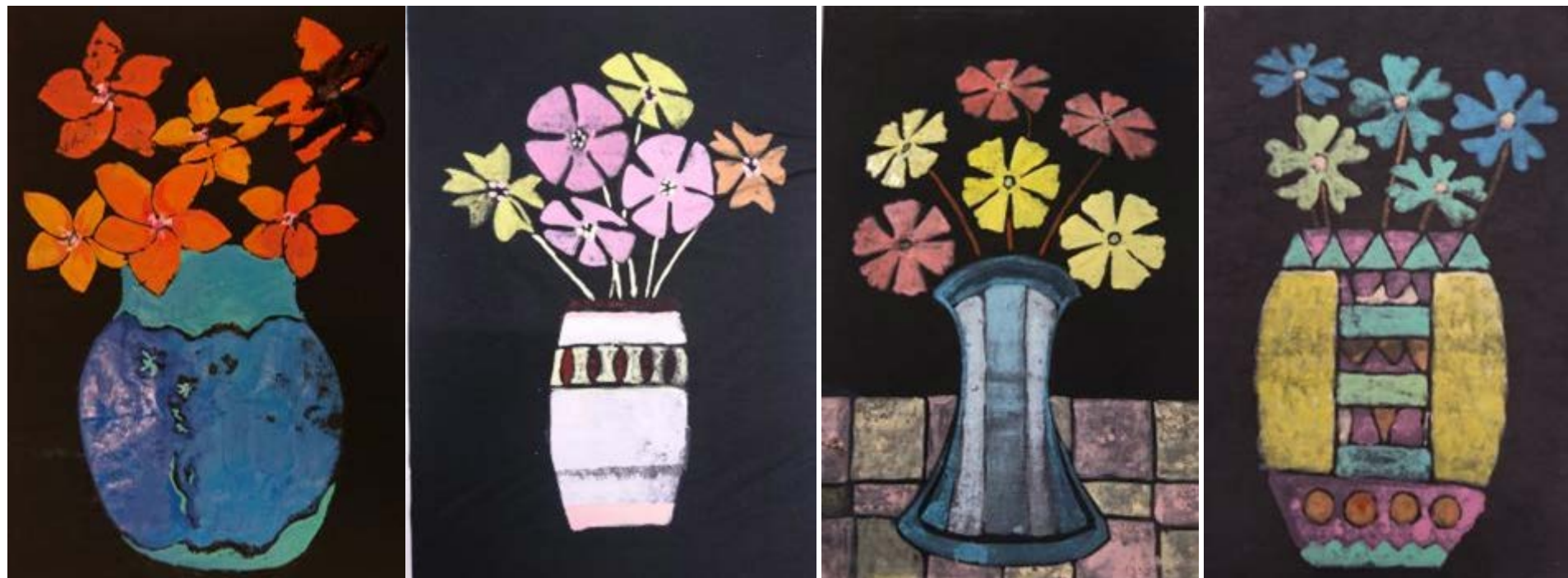
Works by students of pilot schools