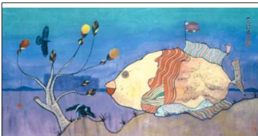
Stripe Fish 1978 Ink and colour on paper 68.5 x 134 cm Collection of the Hong Kong Museum of Art

Show the “Artist Introduction ppt” pp4-5