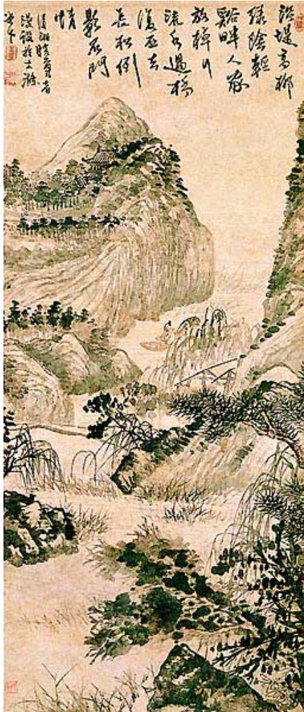
Boating on a Willow Stream Shitao (1642-1707) / Not dated Hanging scroll, ink and colour on paper 127.5 x 54 cm Collection of the Hong Kong Museum of Art