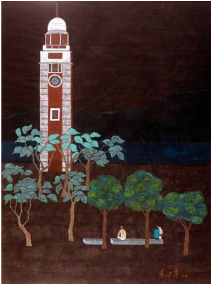
Mother, Child and the Clock Tower (《鐘樓·母與子》) / 2009 Ink and colour on paper