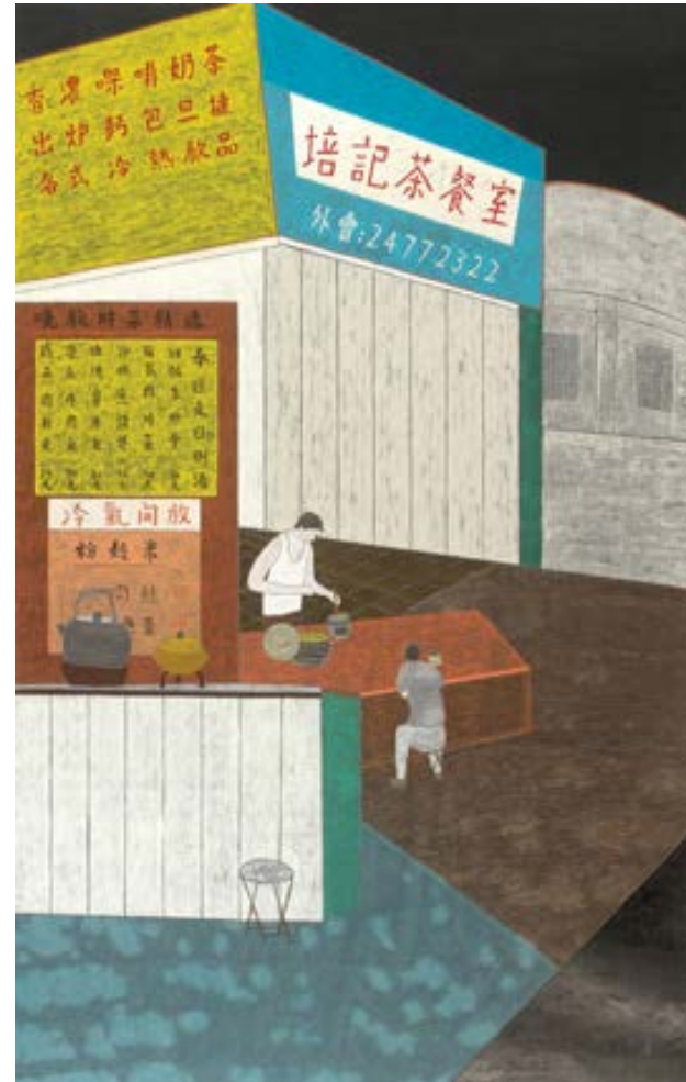
Pui Kee Cha Chan Restaurant (《培記茶餐廳》) / 2009 Ink and colour on paper