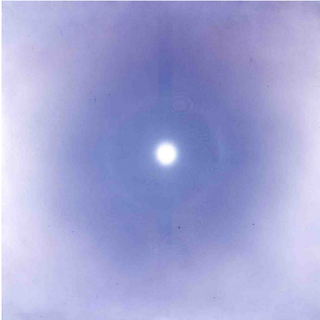
Secret Codes/ 1974 Acrylic on canvas Collection of Hong Kong Museum of Art