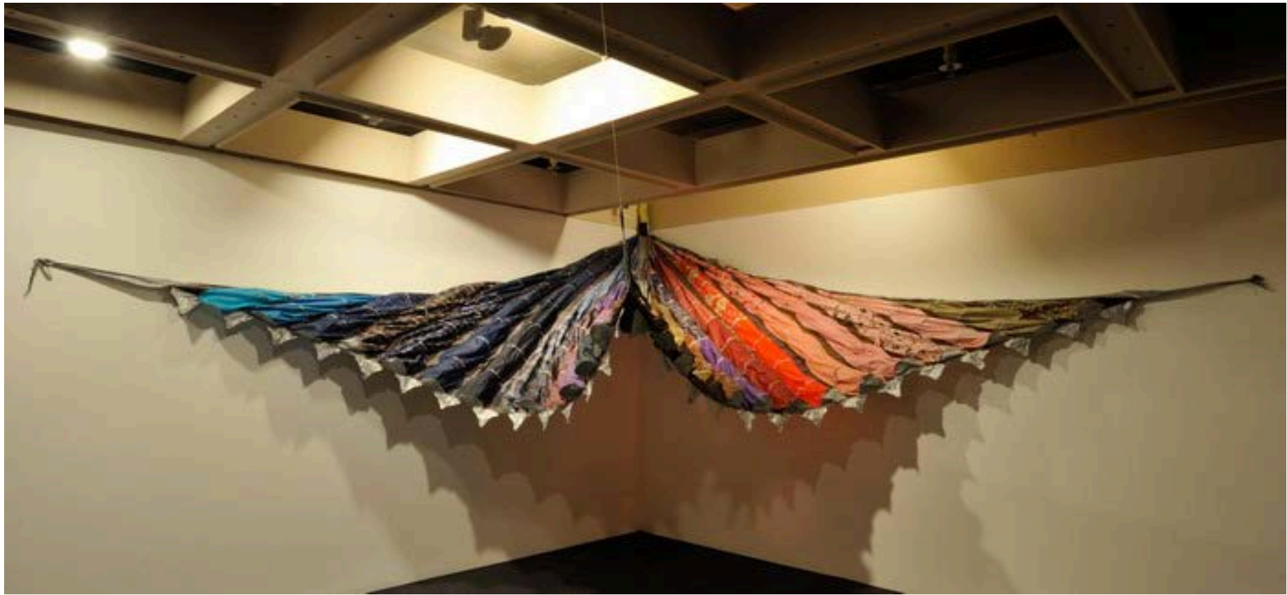
Jaffa Lam Laam Collaborative A Quarter of Pavilion / 2011 Mixed media (recyclable umbrella fabrics) Collection of Hong Kong Museum of Art