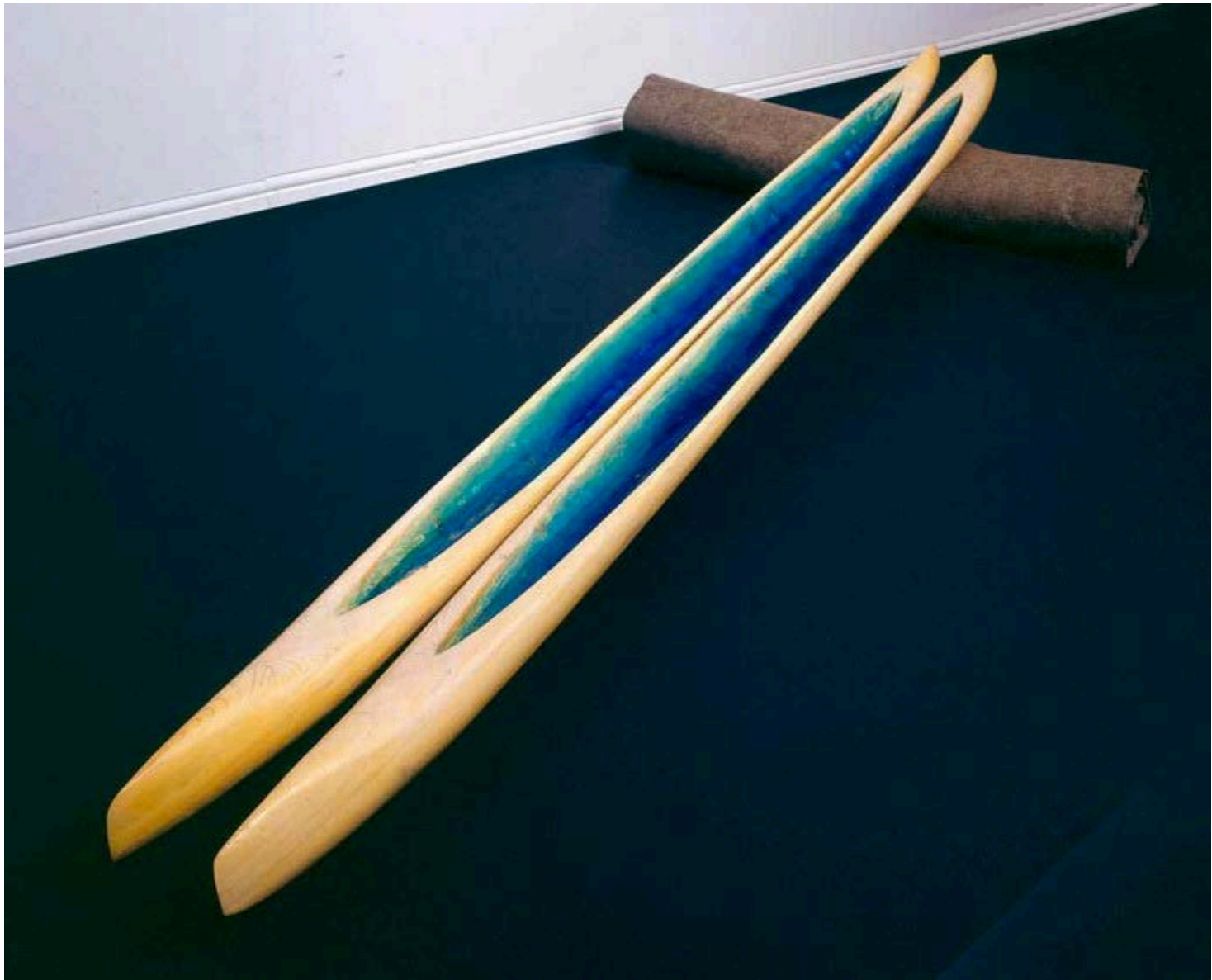
To Someone Who Wants to Cry / 2003 Wood, carpet, water Collection of Hong Kong Museum of Art