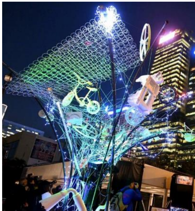
Jaffa Lam Laam Collaborative Wishing Tree / 2017 Mixed media