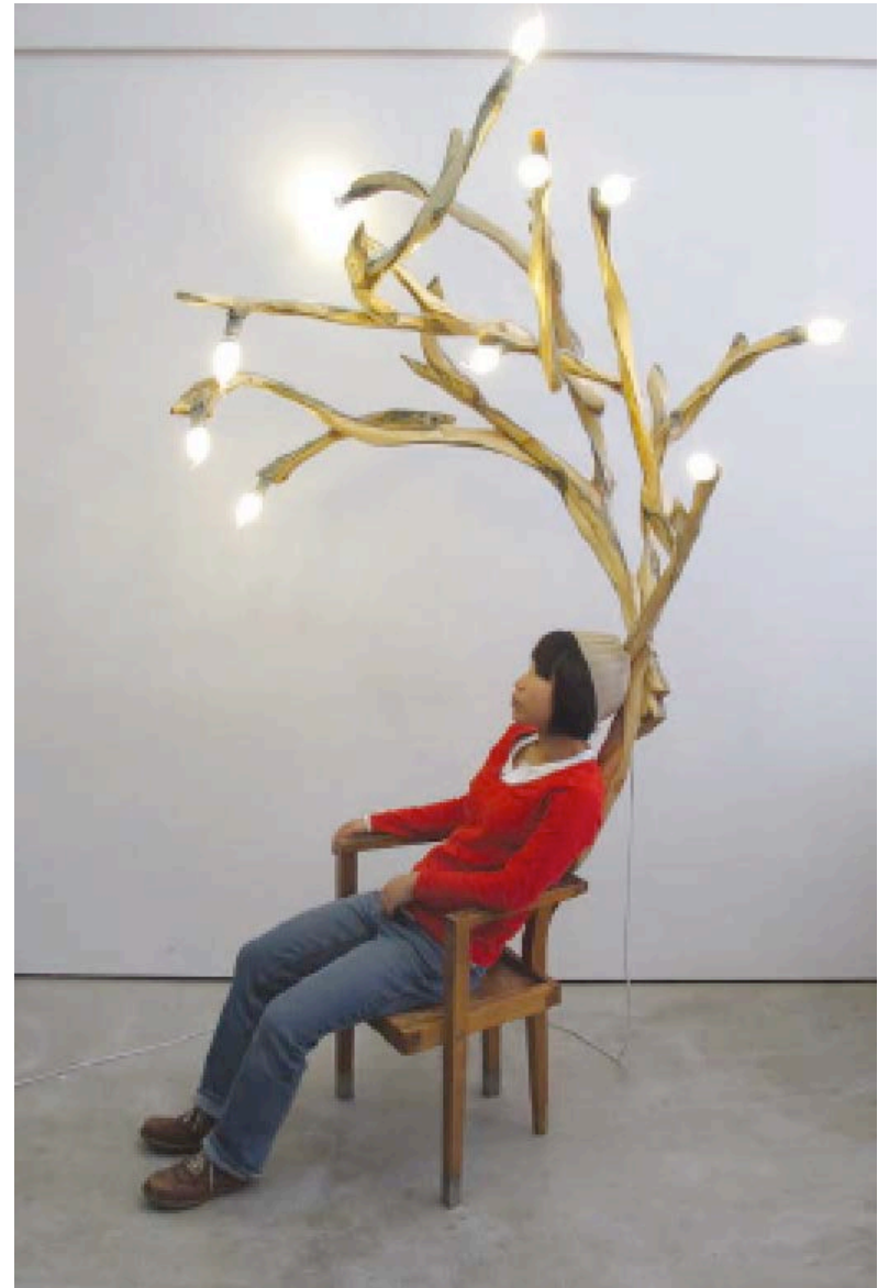
Dust Tree / 2011 Recyclable crate wood, lightbulbs