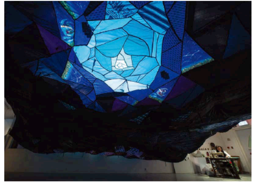
Jaffa Lam Laam Collaborative Blue Heaven / 2012-13 Recyclable umbrella fabrics