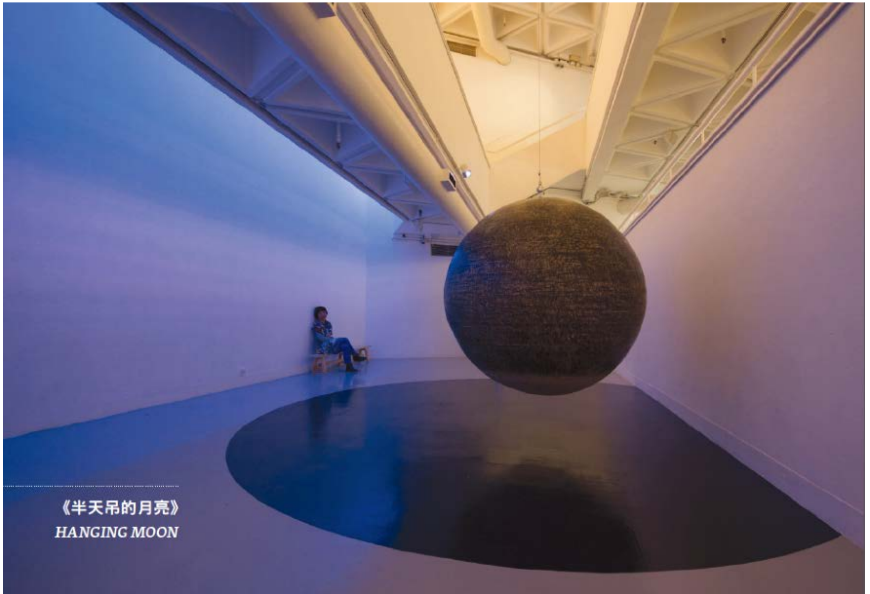
《半天吊的月亮》 HANGING MOON