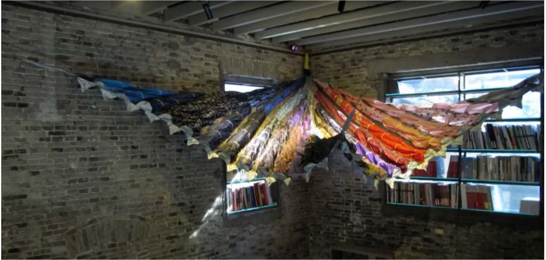
Jaffa Lam Laam Collaborative A Quarter of Pavilion / 2011 Mixed media (recyclable umbrella fabrics )