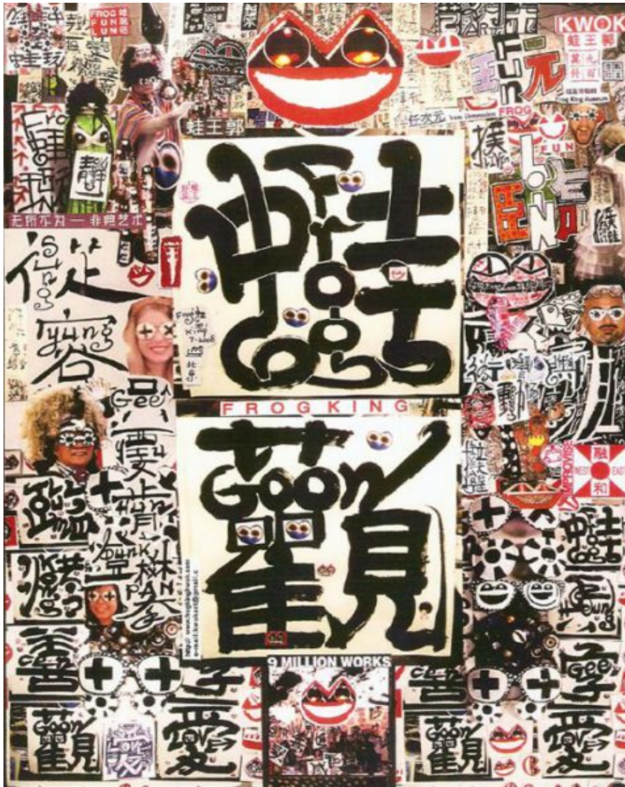
Frogking/ 2012 Mixed Media