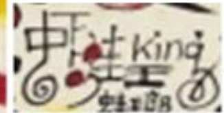
蛙王 - Frog King