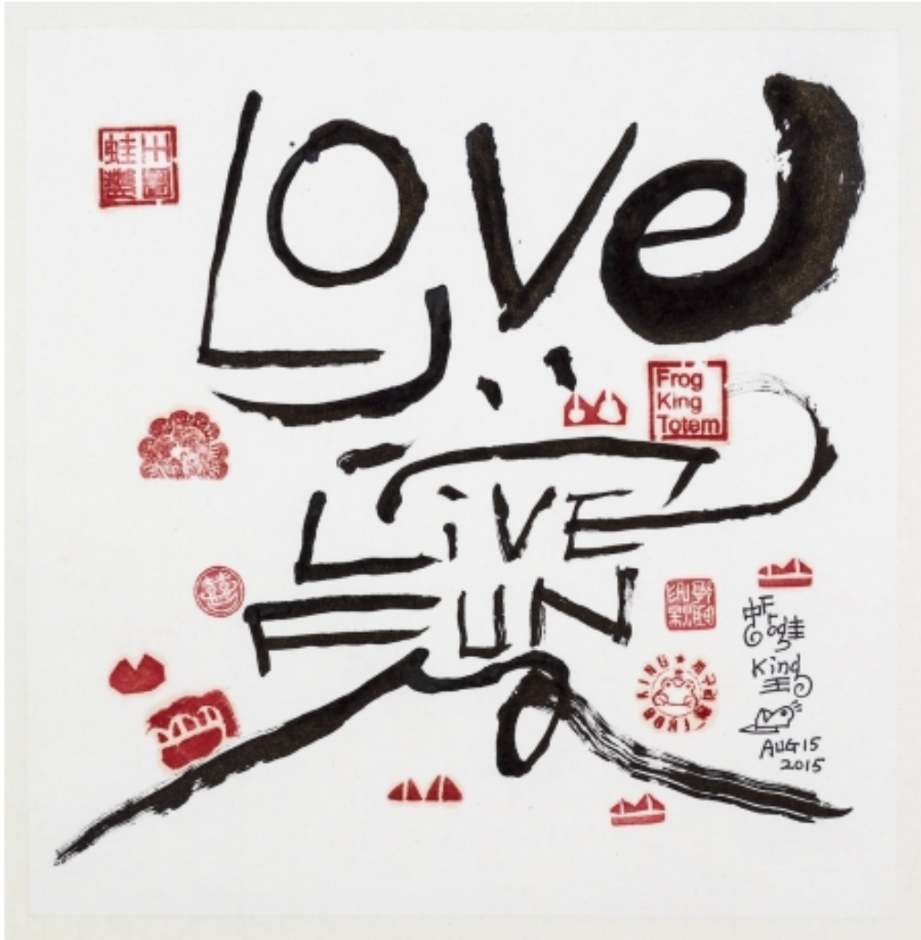
Frogking/ 2012 Mixed Media