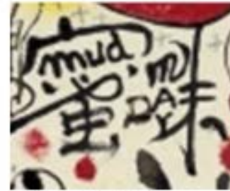
蜜味 - Mud May