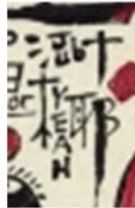
椰汁 - Yeah Jub