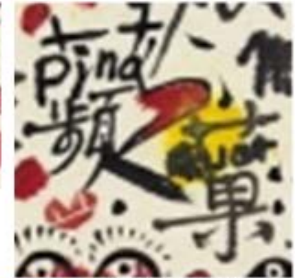
蘋果 - Ping Guog