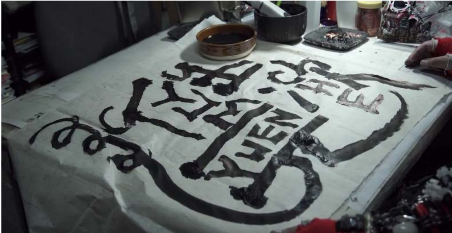
Characters created by KWOK's with "sandwich front"