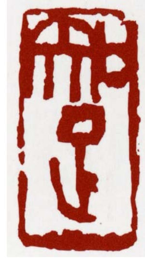
Rectangular seal with two characters carved in relief / 2003