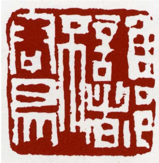
Square seal with five incised characters / 2006