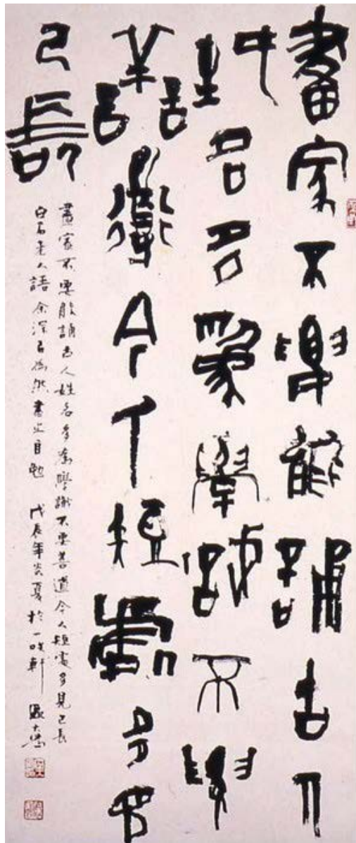
Calligraphy in Seal Script / 1988 Ink on paper