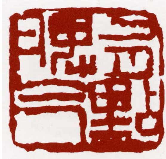
Square seal with four characters carved in relief / 2008