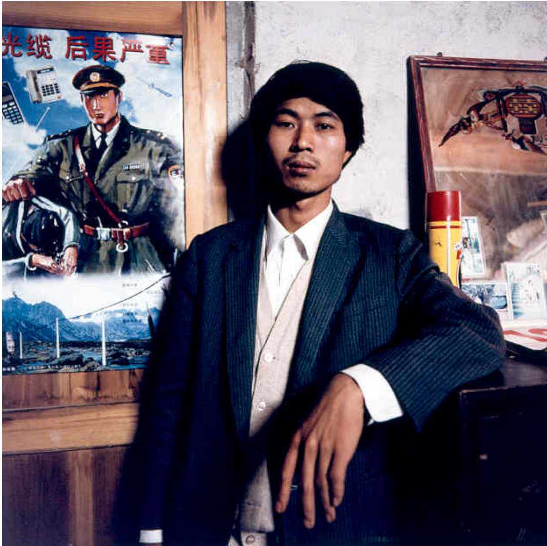
Chinese 1-5 (Section) /1996-2000 Colour photo (Set of five)