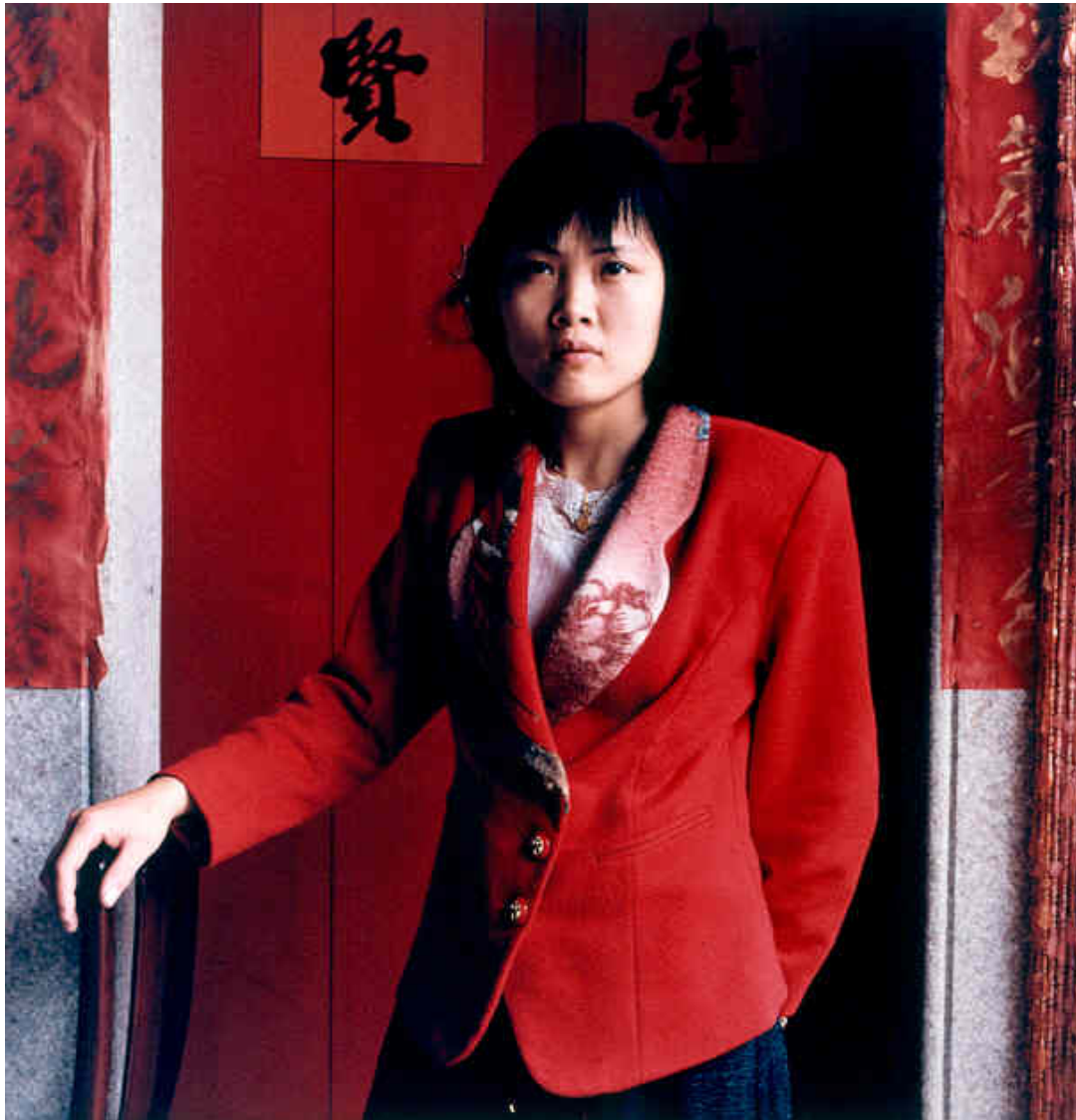
Chinese 1-5 (Section) /1996-2000 Colour photo (Set of five) Collection of the Hong Kong Museum of Art