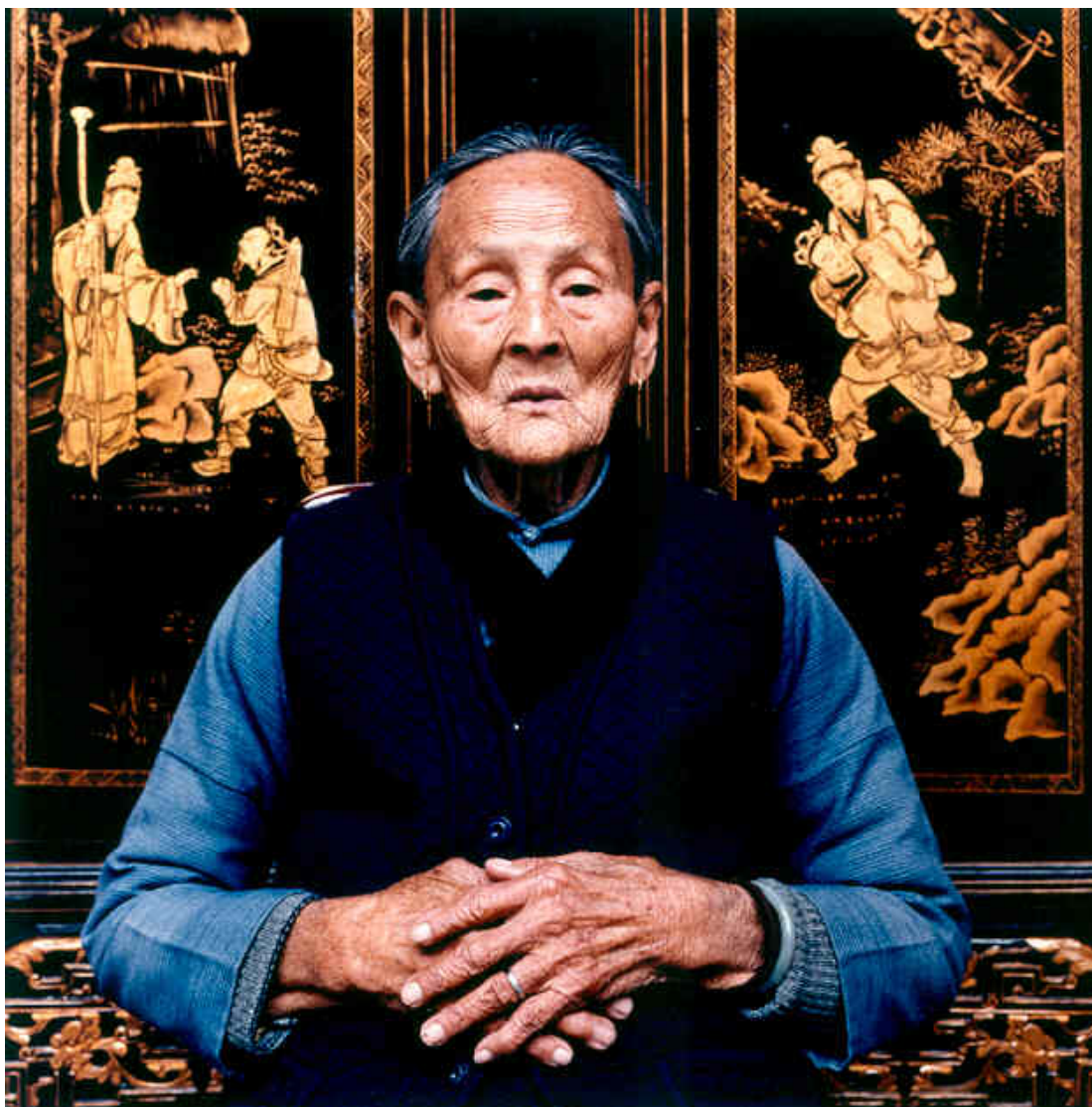
Chinese 1-5 (Section) /1996-2000 Colour photo (Set of five)