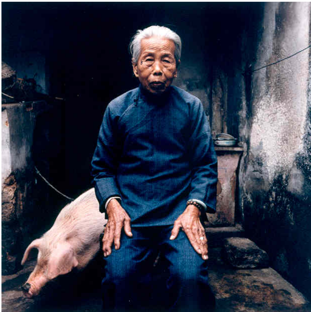
Chinese 1-5 (Section) /1996-2000 Colour photo (Set of five) Collection of the Hong Kong Museum of Art