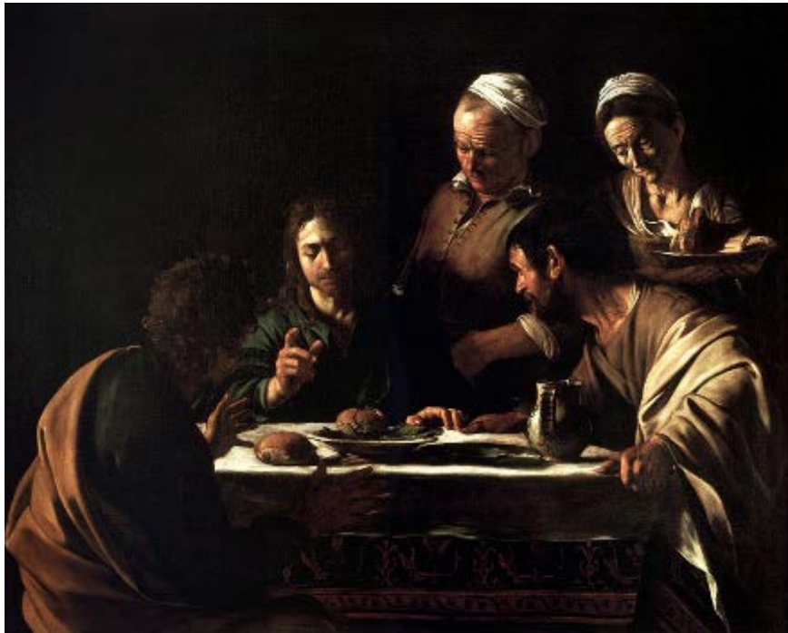
Caravaggio Supper at Emmaus /1606 Oil on canvas Collection of Pinacoteca di Brera