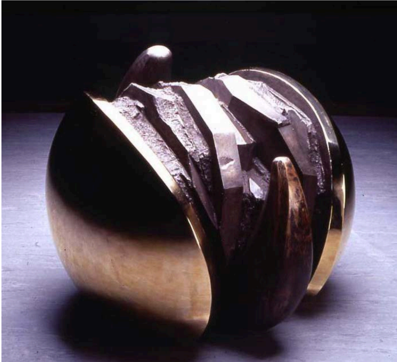
New Born II / 1991 Bronze Collection of Hong Kong Museum of Art