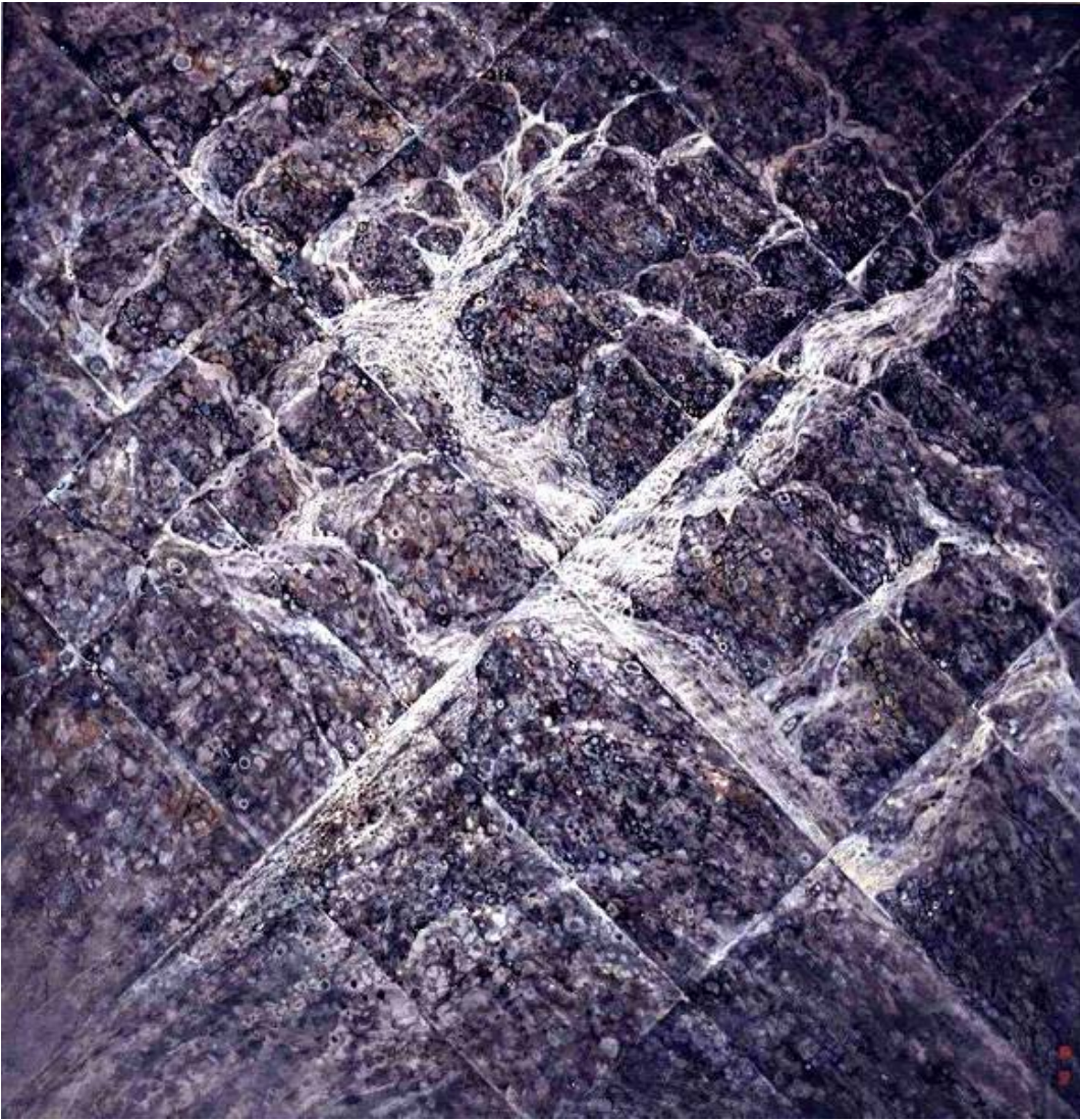
Rapids No. 9 / 1989 Ink and colour on paper Collection of Hong Kong Museum of Art