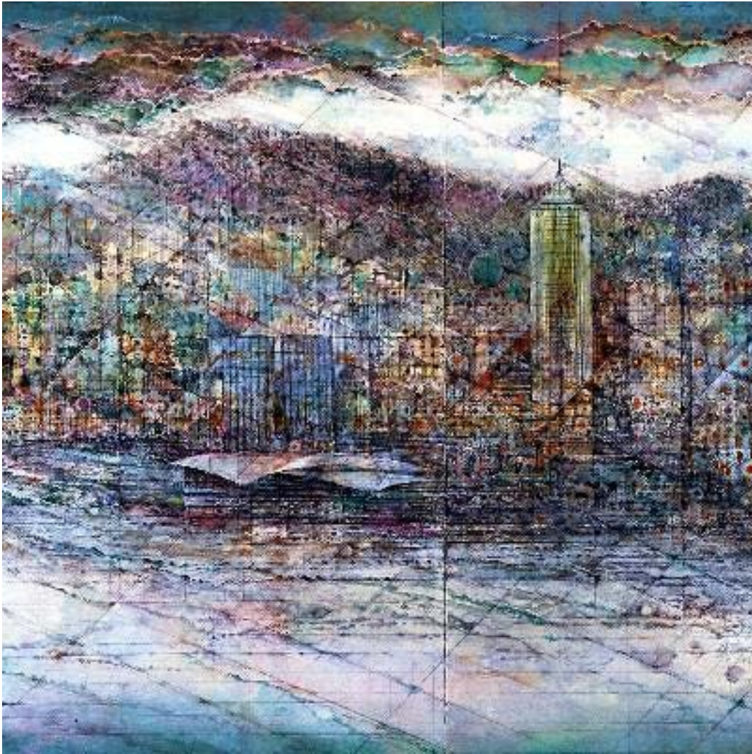
Scintillating Hong Kong Harbour / 1999 Ink and colour on paper Collection of Hong Kong Museum of Art