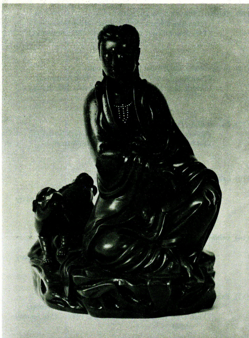
New Acquisition 新增藏品 Bronze Kuan-yin and the mythical beast with cloud pattern silver inlay 17th Century Height: 38cm 錯銀半跏坐觀音與吼銅像 十七世紀 高三十八公分