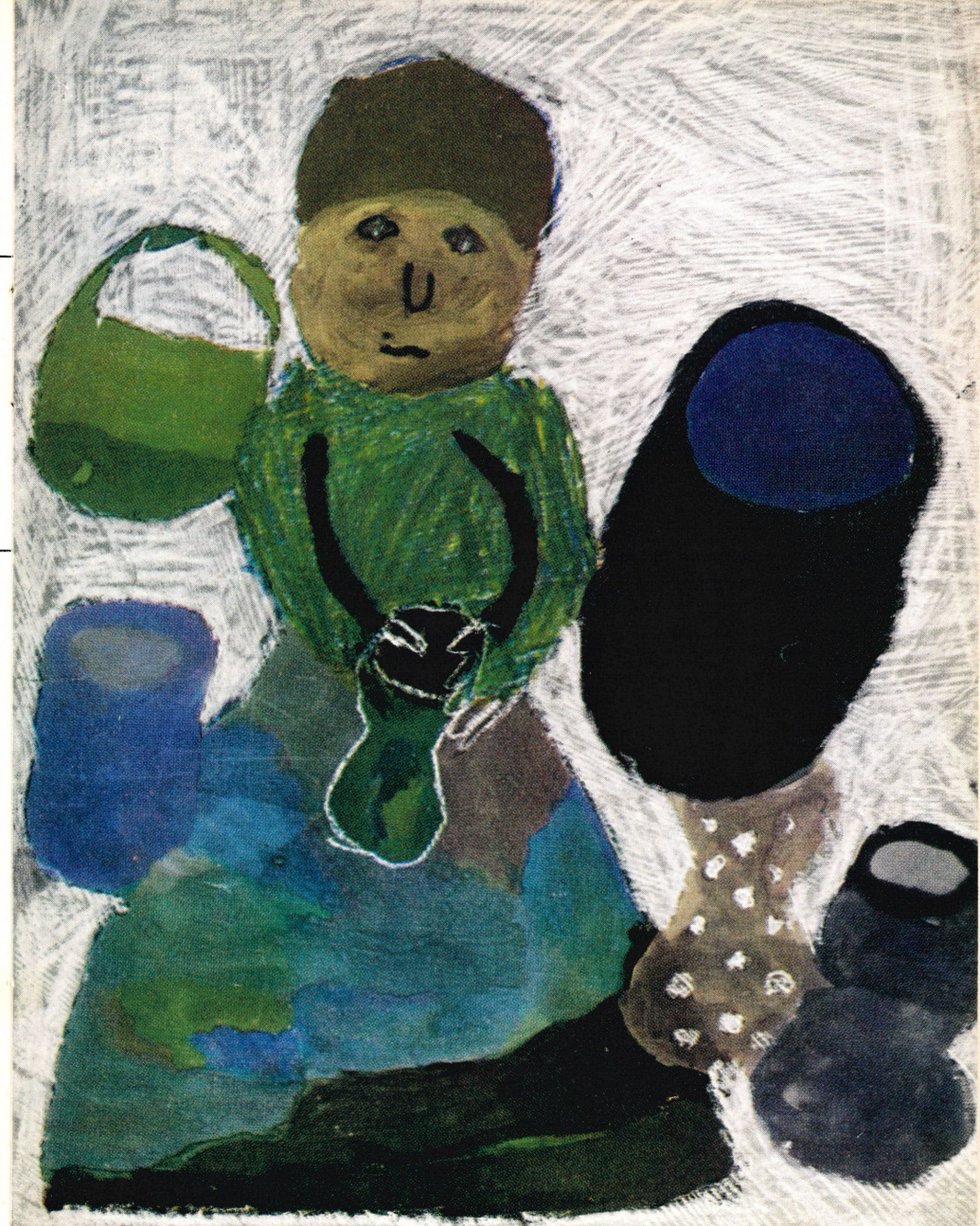
80 Age Nine