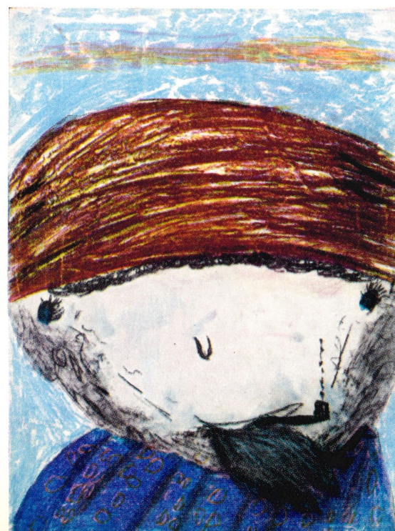
116 Age Eight