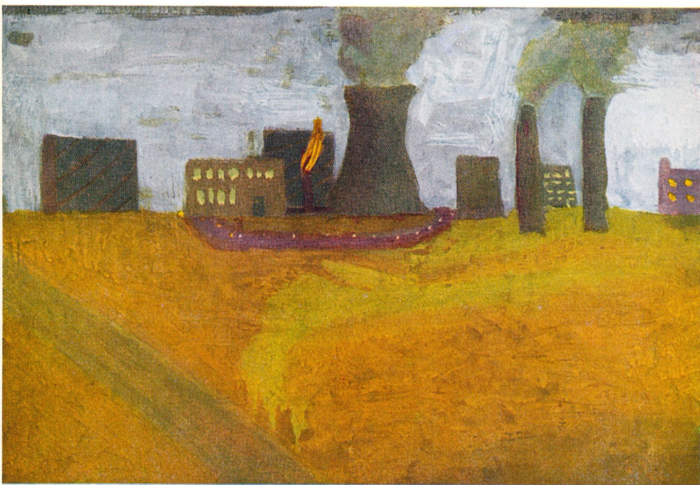
130 Age Eleven