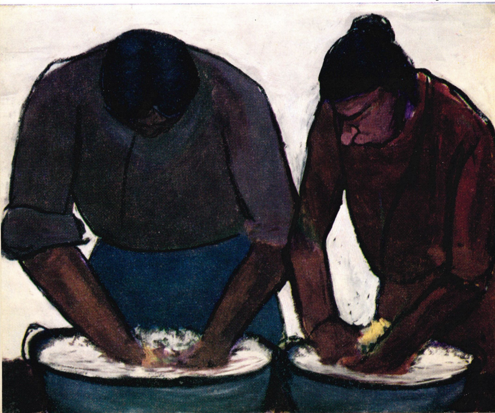
349 Age Fifteen