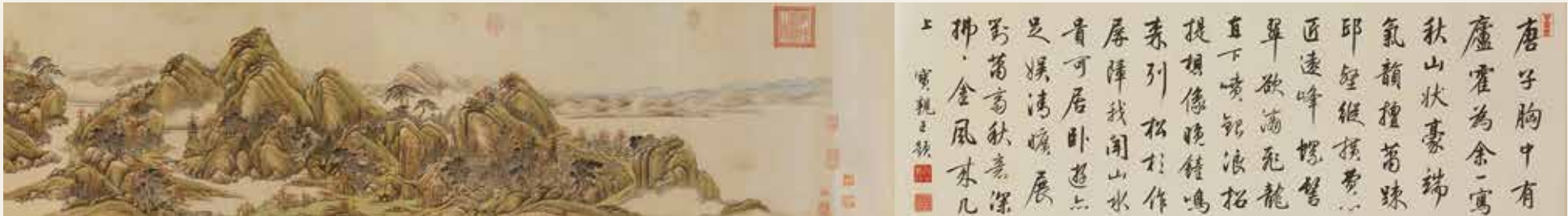
4. 唐岱（1673－1751後），秋山不老圖卷，1733年作，水墨設色絹本手卷，43 x 323 厘米 Tang Dai (1673 – after 1751), Autumn mountains . Dated 1733. Handscroll, ink and colour on silk, 43 x 323 cm