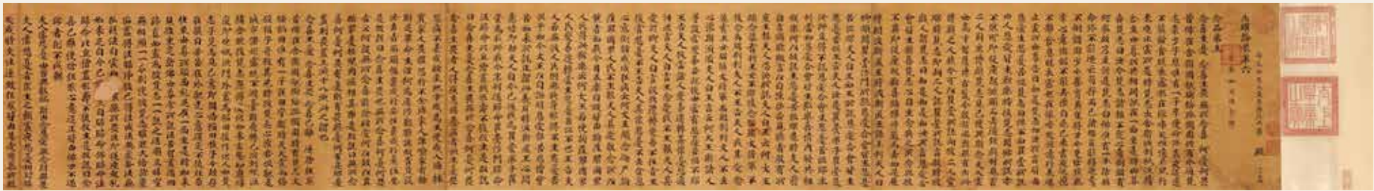
1. 佚名（唐代，618－907），小楷出曜論卷第六，無年款，水墨紙本手卷，26.5 x 1498 厘米 Anonymous (Tang dynasty, 618 – 907), Avadana-sutra, volume 6 in small regular script . Not dated, Handscroll, ink on paper, 26.5 x 1498 cm