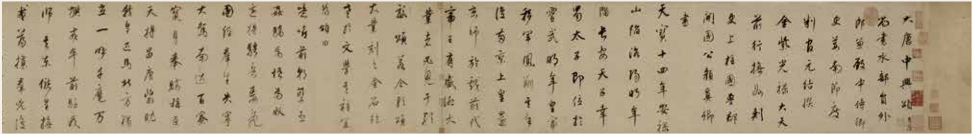
5. 董其昌（1555－1636），行書大唐中興頌，無年款（約1605至1610年作），水墨紙本手卷，28.3 x 611.5 厘米 Dong Qichang (1555 – 1636), Eulogy on the Restoration of the Great Tang Dynasty in running script . Not dated (ca. 1605 – 10), Handscroll, ink on paper, 28.3 x 611.5 cm