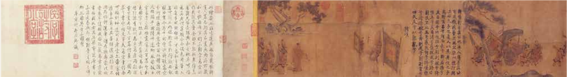
3. 馬和之（活躍於約1130－約1170）（傳），宋高宗（1127－1162在位）（傳），齊風六篇，無年款，水墨設色絹本冊頁六開（卷祿），各26.2 x 65 厘米 Ma Hezhi (act. ca. 1130 – ca. 1170) (attri.), Emperor Gaozong (r. 1127 – 1162) (attri.), Illustrations for the Odes of Qi . Not dated, 6 album leaves (mounted as a handscroll), ink and colour on silk, Each 26.2 x 65 cm