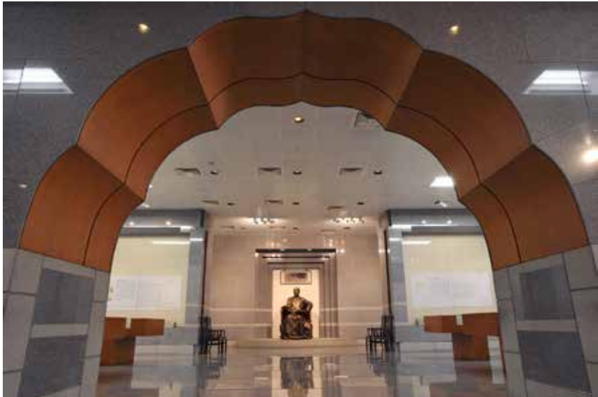
虛白齋藏中國書畫館 The Xubaizhai Gallery of Chinese Painting and Calligraphy

「石渠」之名，出自《漢書》。漢朝初年，丞相蕭何（公元前257年－公元前193年）在長安未央殿的北面建造石渠閣，以收藏秦代的圖籍。以「石渠」為宮廷書畫著錄命名，顯示出清朝帝王景仰古代中原文化傳統的一面。《石渠寶笈》的編纂，由初編至三編成書，跨越乾隆（1711－1799; 1736－1795在位）和嘉慶（1760－1820; 1796－1820在位）兩朝，前後歷經共70餘年，共有31位朝中大臣參與鑑定甄別、遴選，嚴格考訂當中萬餘件書畫作品並編撰著錄。《石渠寶笈》系統地整理了皇室收藏的非宗教類書畫，包括清初歷朝皇帝的遺作、歷代書畫、朝臣貢獻的作品以及當朝皇帝的御筆書畫作品。而宗教類書畫則另收入《秘殿珠林》。