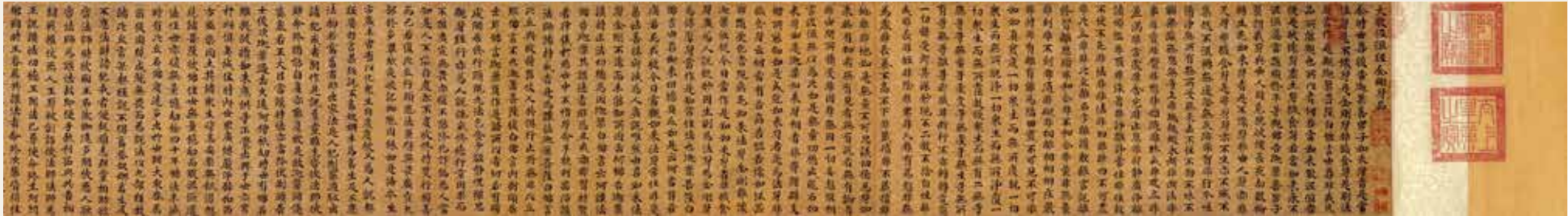
2. 佚名（唐代，618－907），小楷大般泥洹經金剛身品第六，無年款，水墨紙本手卷，23.8 x 432.8 厘米 Anonymous (Tang dynasty, 618 – 907), Mahaparinirvana-sutra (The Great Parinirvana Sutra), chapter 6 in small regular script . Not dated, Handscroll, ink on paper, 23.8 x 432.8 cm