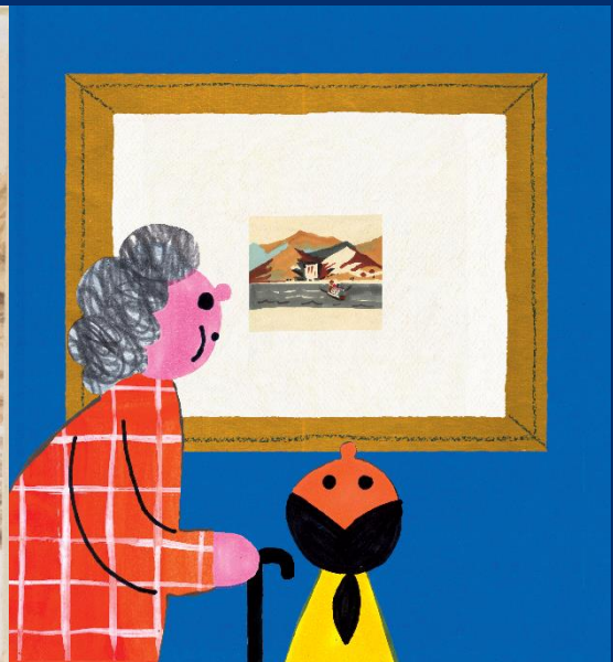
William Havell (1782 – 1857) (attri.) Waterfall at Aderdeen, Hong Kong ca. 1816 Watercolour on paper 10.5 x 16 cm